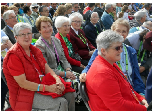
Sisters and a Consecrated secular wait for Mass to begin

hour “Festival of Families” for 70,000 people in Croke Park, the famous stadium in North Dublin- a breathtaking show, full of song, dance, and joy – and a rapturous welcome for the Pope, when he was driven around to greet the people from his small Pope mobile.