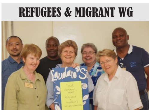
Some members of RMWG

The main objective of our working group is to ensure that the plight of refugees and migrants is a visible concern for our religious congregations. We try to provide members and other interested JPIC promoters with an avenue for reflection and deeper understanding of issues related to refugees and forced migrants. We network with agencies working in this area and we try to facilitate awareness among congregations and encourage action on their behalf. We develop and share resources, provide information, advocate, and try to raise consciousness of migration issues among religious around the world. We learn from each other and share our experiences, for example, with migrants in countries where our congregations are present or where we give hospitality and accommodation to migrants in our religious houses in Rome. Our methodology is based on the Church's social justice cycle of 'See, Judge, Act'. Our focus in this working group is on the issue of migration but we emphasise that all the working groups are connected and we work to highlight the interrelationships. The Papal Encyclical Laudato Si' has provided important 'See, Judge, Act' insights on the issues of migration.