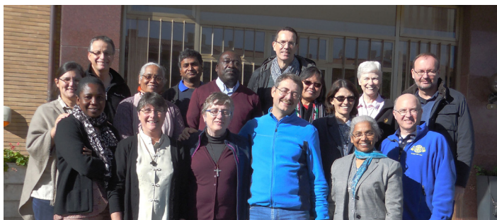
Participants at the Formation Workshop

The days provided the new JPIC Promoters with the tools needed to animate members of their congregation in justice, peace and integrity of creation (JPIC), by giving an overview of a variety of themes: the meaning of JPIC; congregational JPIC structures; the spirituality of JPIC in relation with religious vows; formation in religious life; the role of a JPIC promoter; JPIC Commission organization; networking in JPIC and a JPIC framework for planning in the congregation. One important aspect of this year's workshop was the fact that among the participants there were members of general councils from three congregations. This shows that there is a growing awareness of JPIC as an integral part of animation for their communities around the world. We had a very energizing, thoughtful and spiritually enriching time together in our efforts to promote JPIC in the life of the Congregations. The JPIC Commission Secretariat is grateful for all those who came to share their experiences in various areas of their groups and networks.