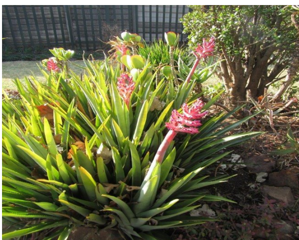
Delightful garden outside our north-facing door