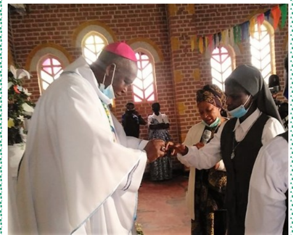
These two photos from Uganda