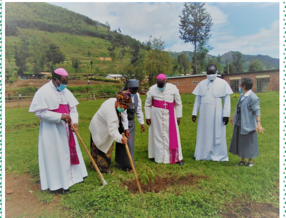
These two photos from Rwanda