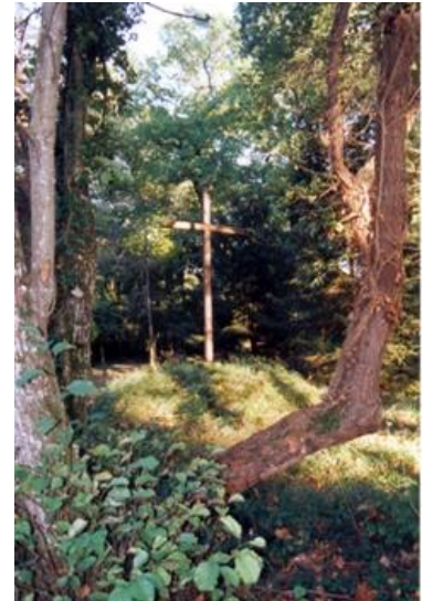
Cross of God Alone, Martillac

To live like this In today's world, we need to face the challenge of opposition