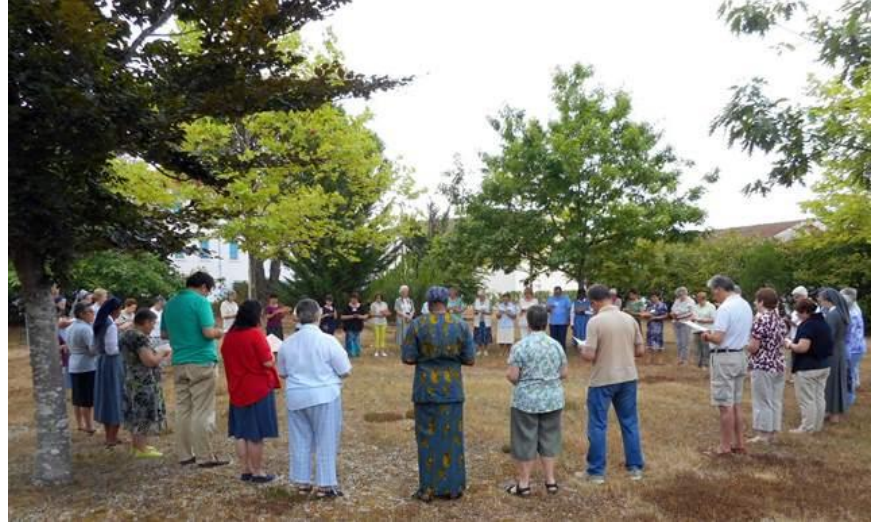
Prayer in the Contemplatives' garden

Today, the last day of the meeting, began and ended outdoors: Morning Prayer in the "Contemplatives Garden" just outside the Hall; the Closing Eucharist on the Island: an opportunity to connect with the Good Father's desire to make of La Solitude a place of beauty and peace, and also with Pope Francis' important Encyclical.