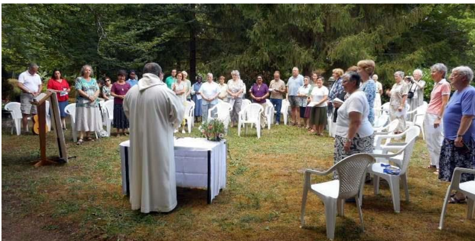
At the Mass on the Island

Whatever point each one of us has reached, let us welcome the words of our Founder who today tells us once more to "Go Forward"!