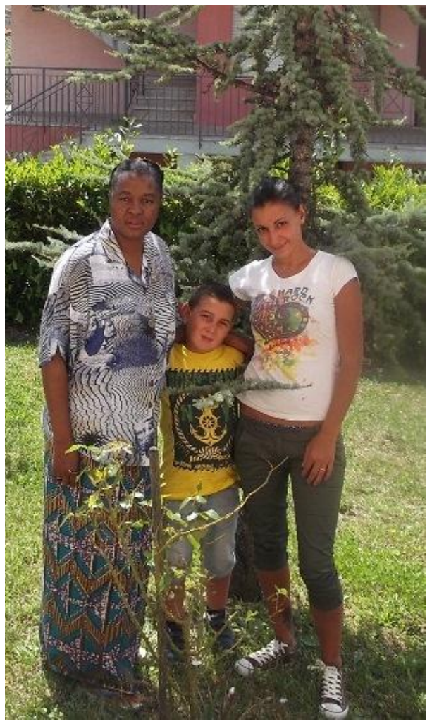
Thank God for nature, for these magnificent mountains, valleys, rocks and the vegetation which form the wonderful eco-zone of this area. Thank you for all the opportunities that I had to enjoy it while here.

I had many opportunities of joining in your prayer or conversations where I heard about your concern to see our world grow in love, justice and peace. Thank you so much for all that.